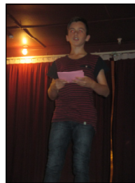
2015 Buckland School Speech Winners