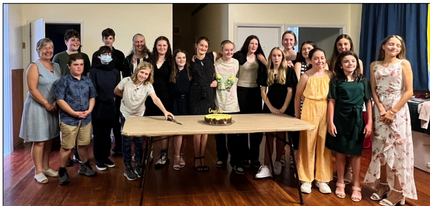
Year 8 Graduation Dinner