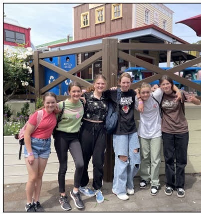
Year 7 & 8 Care Day at Rainbows End