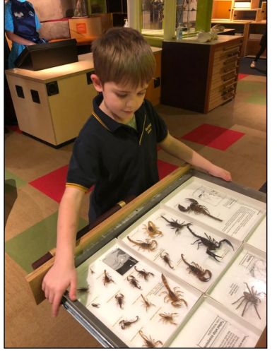
Year 1 & 2