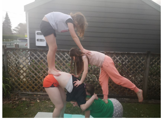
Please keep sending your photos in. I will put as many as I can in the newsletter each week.