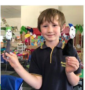
Buckland Spoonville is taking shape